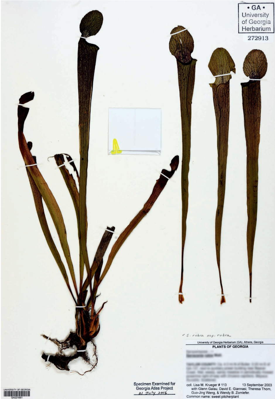
Figure 1: Sarracenia rubra subsp. viatorum specimen at the University of Georgia Herbarium. Some portions of the image blurred for security reasons.